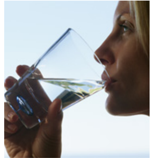
Stay hydrated to keep energy up.